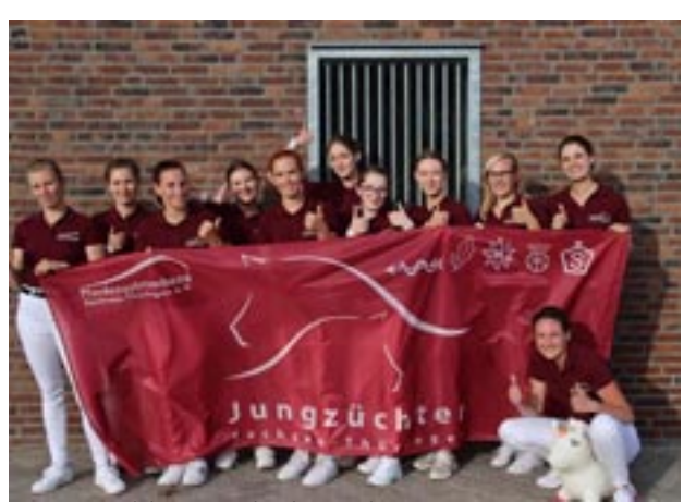
Team spirit and motivation are important to young breeders

The participants range from ages six to 25 and are classified in four age groups. The best 12 competitors of age